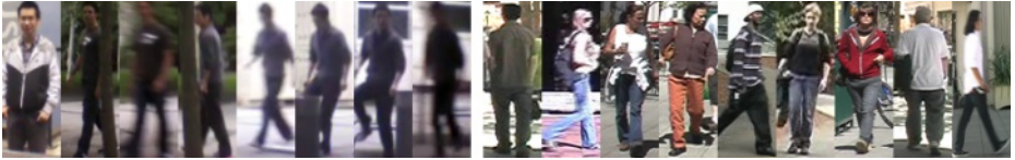
Fig. 1. Illustrating key differences in person detection quality when automatically detected from mobile re-identification platform video (MRP, left), compared to detections in a standard re-identification dataset, VIPeR (right). Notably, the VIPeR images (i) are in perfect register, (ii) feature standard walking poses from a limited number of relative angles. Contrastingly, the MRP images are unregistered, feature more varied pose and also occasionally heavy motion-blur because of the relative motion of the MRP to the target person during transit.

tified tasks; (iv) We elucidate the unique challenges posed by MRP re-id and discuss their implications for general re-id research going forward.