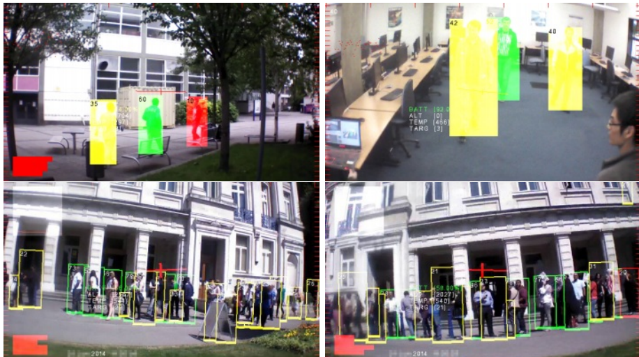
Fig. 3. Screen captures from our mobile re-identification platform’s data capture sessions; illustrating real-time person detections colour-coded by detection confidence. The top-left and top-right images illustrate typical operator views from the outdoor and indoor flights from Dataset 1; The bottom row illustrates Dataset 2.

ensemble of local features [12] (ELF), which encodes both color and texture in 6 horizontal strips [25] for final features of 2784 dimensions.