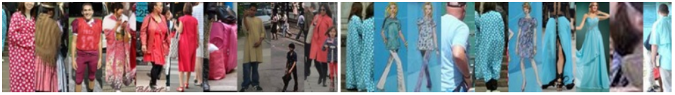
Figure 4: Querying "red shirt" and "blue shirt" in our 69,000 non-labelled internet-sourced images via a transfer mapping between our attributes and expert-ontologies from [18]

our representation provides a simple distributed encoding of conventional expert-defined attributes. This has implications for applications beyond re-identification in surveillance: by connecting existing expert-defined attribute ontologies from surveillance to internet data sources, we gain the ability to query internet images for attributes without additional annotation of internet data or training new classifiers for the internet domain.