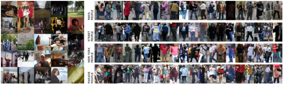
Figure 2: (Left) Uncurated images from our internet search. Many images are unsuitable for surveillance attribute learning as they contain no people or are too close-up. (Right) Some person detections automatically extracted from uncurated internet photographs. Each row comprises images from a discovered cluster, explicitly labelled on the left side. Noteworthy are the high variations in pose and appearance, fashion and background, as well as lighting and how the fashion varies according to location.

training – in order to trade off data volume and label noise. After conservatively thresholding person detection confidence, we are left with 69,000 person crops with corresponding meta-text features.