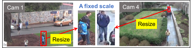
Figure 1. Illustration of scale alignment of person bounding boxes captured at different scales (resolutions) in public space.

Person re-identification (re-id) aims at matching identity classes of person images across non-overlapping camera views deployed over open surveillance spaces. This is an inherently challenging task because person visual appearance may change dramatically in different camera views due to unknown covariates in human pose, view angle, illumination, occlusion, and background clutter [16]. Existing works focus on designing identity discriminative feature representation [17, 13, 74, 29, 38, 36] or learning matching distance metrics [22, 68, 77, 64, 40, 72, 62, 63, 65, 8] or their combination in a deep learning framework [25, 3, 60, 67, 51, 66]. By aligning local body parts for feature extraction followed by cross-view matching, existing methods often resize all the person bounding box images into a single scale as a canonical pre-processing normalisation step [32, 27, 78], that is, existing re-id models assume a normalised single-scale based re-id. This, however, is against that person images are almost always captured in